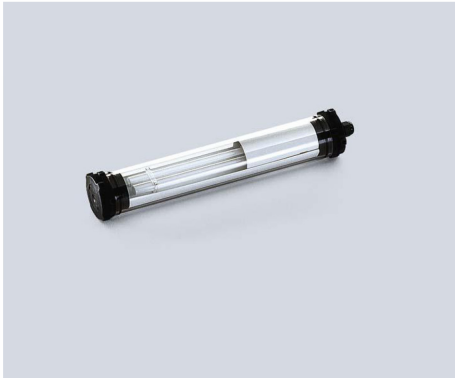
RL70C - 118 S